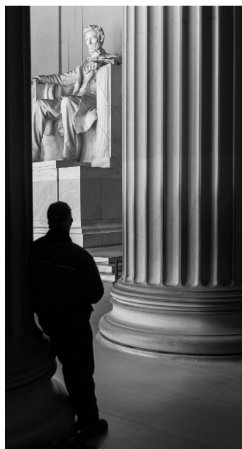
Contemplating Lincoln by Jim Roach

Questions: exhibits@wasatchcameraclub.com