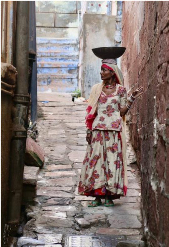
Woman in Jodphur