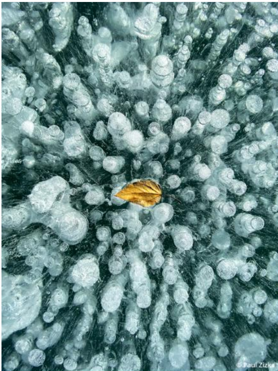
A lone leaf is trapped among methane-filled layers of ice as winter engulfs Abraham Lake.

Microbes at the bottom of the lake release methane, which floats to the surface in bubbles. When the water freezes in winter, these bubbles become trapped, creating interesting compositions for photography.