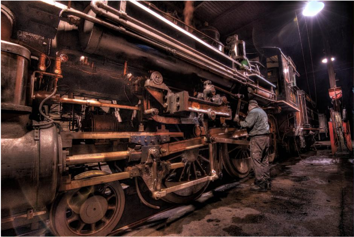
Ely Railroad 2 by Brent Ovard