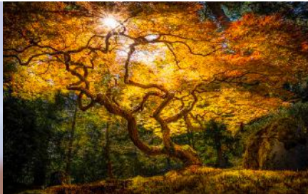
Illumination (Best of Show)