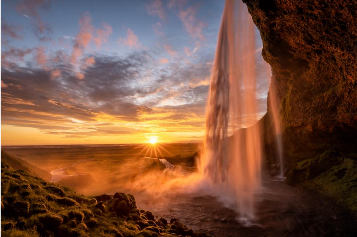
Midnight Seljalandsfoss by Bill Bradford – Best of Show*