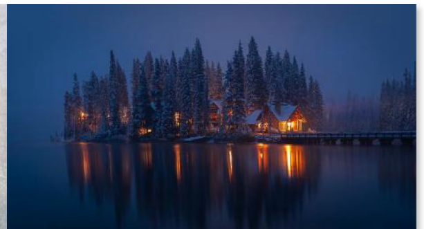
Dreamland (PSA Award of Merit)