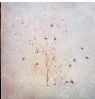
Life in Pastel