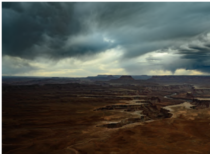
Threatening Skies Over the Canyon by Chuck Dillard